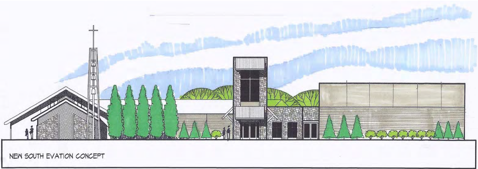
NEW SOUTH EVATION CONCEPT